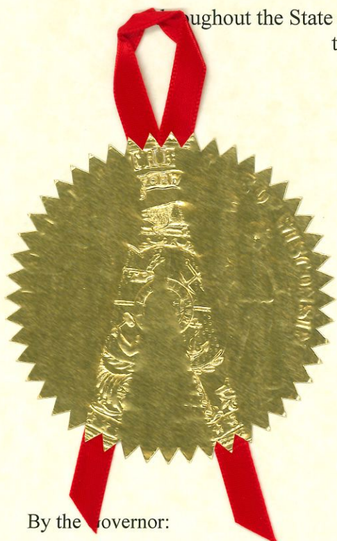
TONY EVERS GOVERNOR

IN TESTIMONY WHEREOF, I have hereunto set my hand and caused the Great Seal of the State of Wisconsin to be affixed. Done at the Capitol in the City of Madison 27 th day of August 2021.