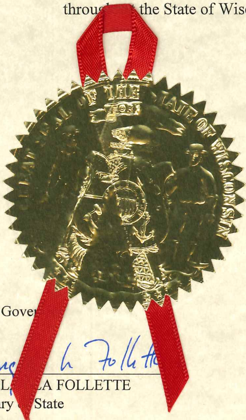
TONY EVERS GOVERNOR

IN TESTIMONY WHEREOF, I have hereunto set my hand and caused the Great Seal of the State of Wisconsin to be affixed. Done at the Capitol in the city of Madison this 16 th day of January 2019.