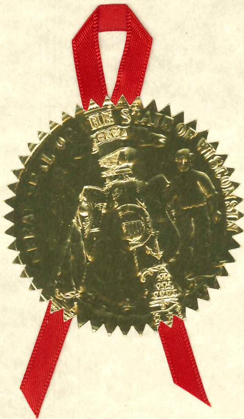
TONY EVERS GOVERNOR

IN TESTIMONY WHEREOF, I have hereunto set my hand and caused the Great Seal of the State of Wisconsin to be affixed. Done at the Capitol in the city of Madison this 24 th day of January 2019.