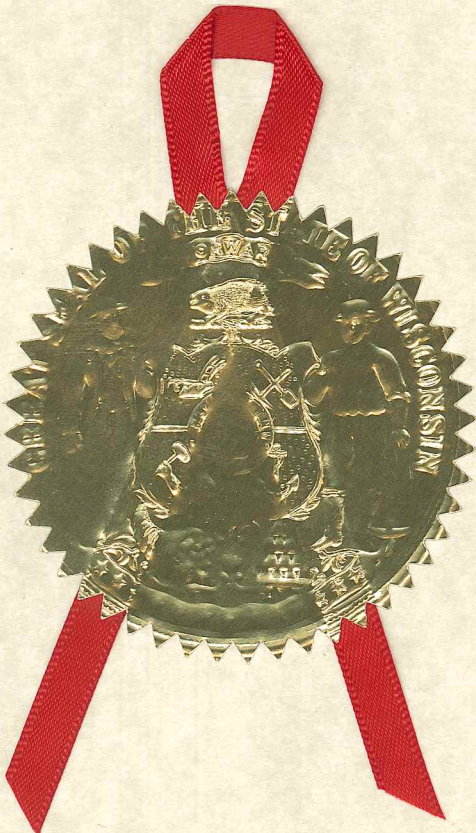
TONY EVERS GOVERNOR

IN TESTIMONY WHEREOF, I have hereunto set my hand and caused the Great Seal of the State of Wisconsin to be affixed. Done at the Capitol in the City of Madison this 1 st day of February 2019.