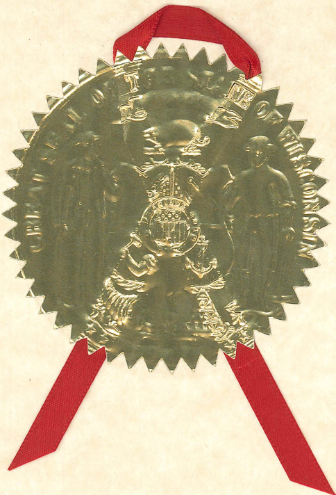
TONY EVERS GOVERNOR

A handwritten signature in black ink that reads "Tony Evers".