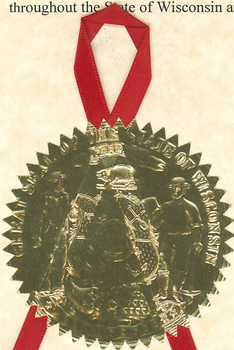
TONY EVERS GOVERNOR

A handwritten signature in blue ink that reads "Tony Evers".