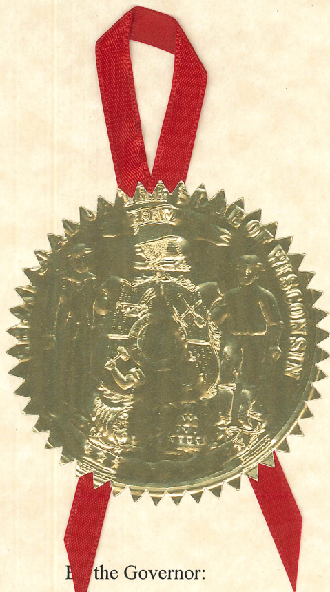
TONY EVERS GOVERNOR

A handwritten signature in black ink that reads "Tony Evers".