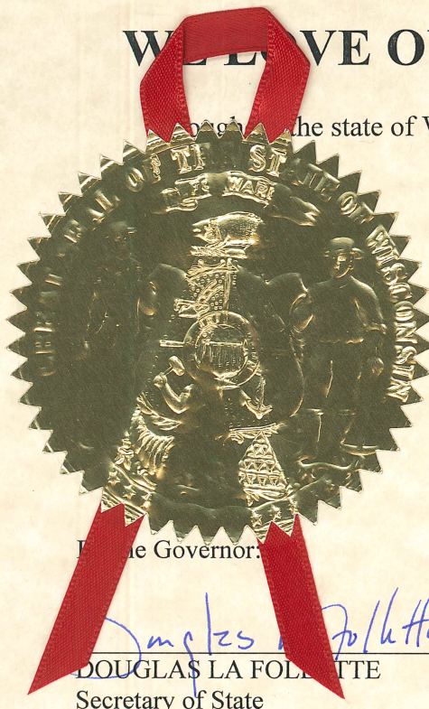
TONY EVERS GOVERNOR