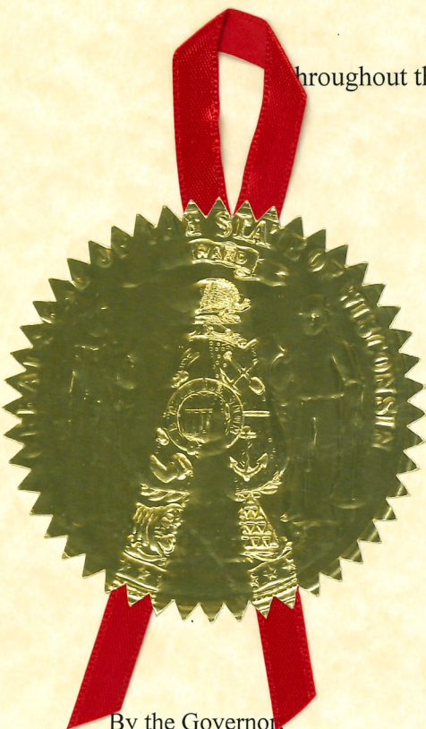
TONY EVERS GOVERNOR

A handwritten signature in black ink that reads "Tony Evers".