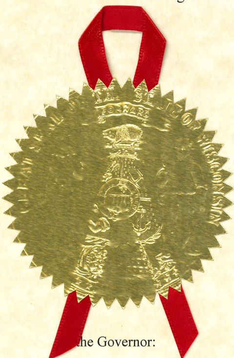
TONY EVERS GOVERNOR

A handwritten signature in black ink that reads "Tony Evers".