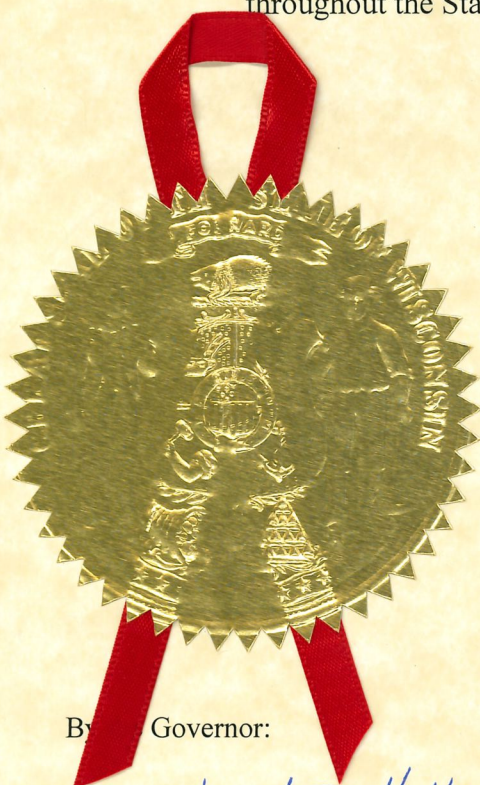
TONY EVERS GOVERNOR

A handwritten signature in black ink that reads "Tony Evers".