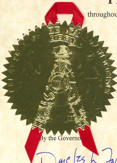
TONY EVERS GOVERNOR