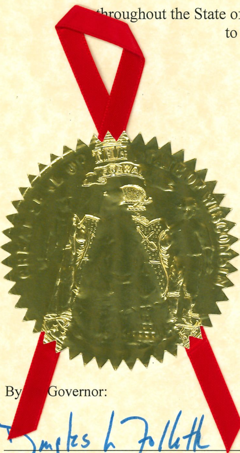
TONY EVERS GOVERNOR

A handwritten signature in black ink that reads "Tony Evers".